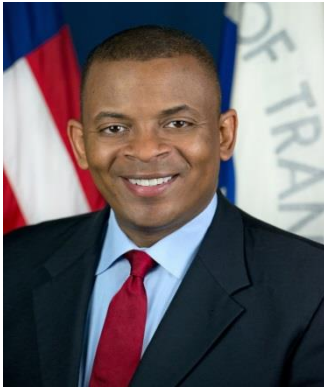
Anthony Foxx Secretary of Transportation