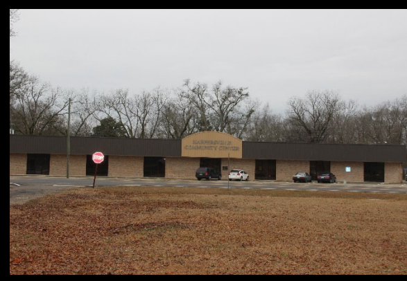
Harpersville Community & Senior Center