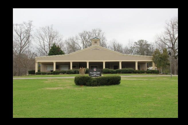
Heardmont Senior Center