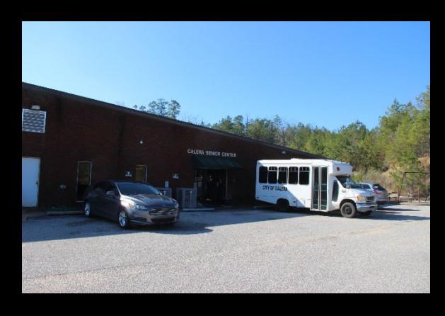
Calera Senior Center