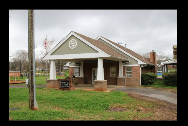
Montevallo Senior Center