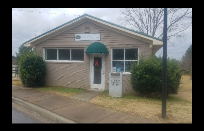
Westover Senior Center