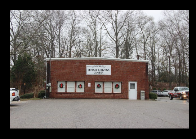
Helena Senior Center