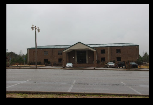
Helena Community Center