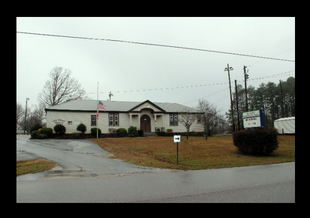
Pea Ridge Senior Center