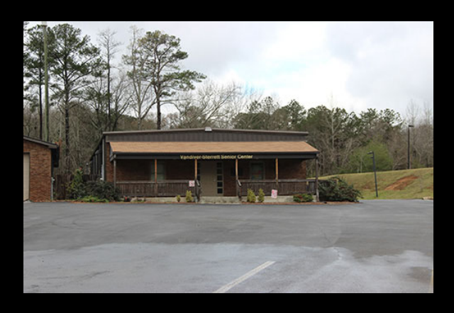
Vandiver-Sterrett Senior Center