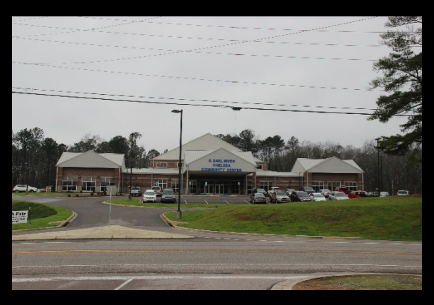
Chelsea Community Center