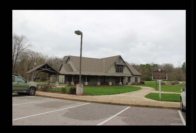
Alabaster Senior Center