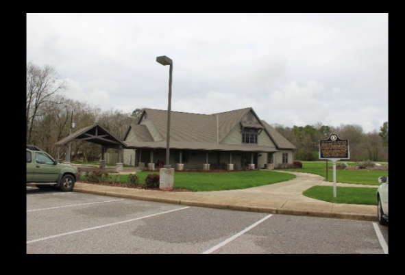
Alabaster Senior Center