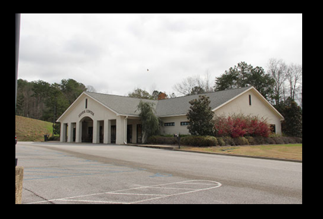
Pelham Senior Center