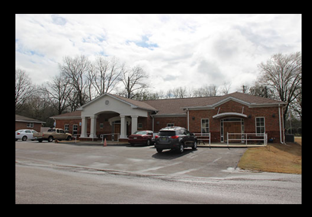
Columbiana Senior Center