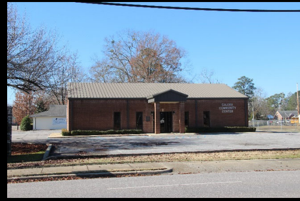
Calera Community Center