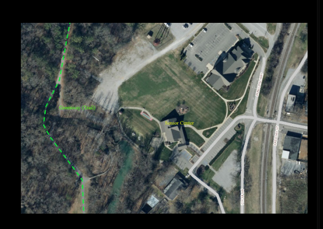
Buck Creek Greenway