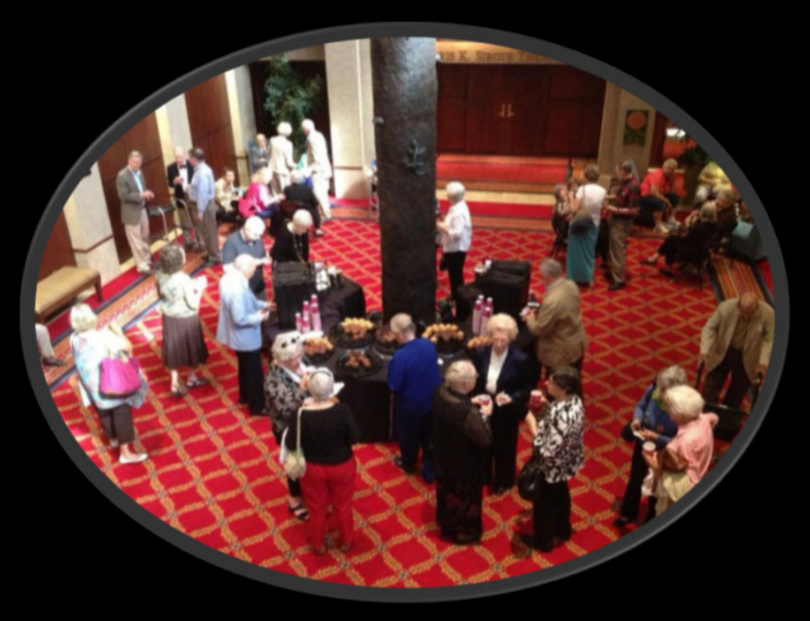
Seniors Visit to McWane Science Center