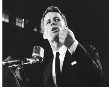
Robert F. Kennedy

“Each time a man stands up for an ideal, or acts to improve the lot of others, or strikes out against injustice, he sends forth a tiny ripple of hope, and crossing each other from a million different centers of energy and daring those ripples build a current which can sweep down the mightiest walls of oppression and resistance.”