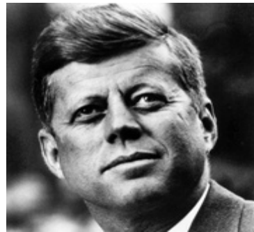
John F. Kennedy

“Leadership and learning are indispensable to each other.”