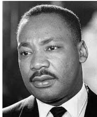
Martin Luther King, Jr.

“We may have all come on different ships, but we’re in the same boat now.”